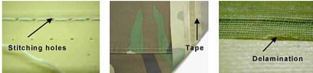
Fig.1. Typical sealing characteristics

In these applications highly engineered fabrics provide a barrier to particles, liquids or gases. The main limitation however is the joining of these fabrics as sewing penetrates the material and resealing is required in a second taping process. Alternative sealing methods using hot melt adhesive tape are emerging, but these all use an additional layer between the fabrics at the seam. The current procedures are time consuming, highly labour intensive and the use of tape is limited in applications using complex 3D seams. Additionally, because of the limited peel strength of taped seams and the continuous bending of the joints during use as well as maintenance and washing, the sealed seam often delaminates (see Fig. 1).