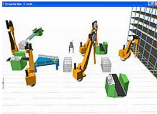
Fig.7. Simulated example of automation using laser welding of textiles

A simulated automated manufacturing environment is shown in Figure 7 .