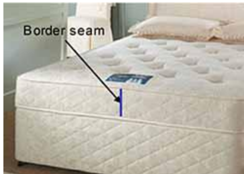
Fig.6. Application tested in mattress construction

Suitable jiggging was prepared to support the ends of the border in a peel joint configuration such that both free ends of the fabric were hidden on the inside of the border. The weld obtained was strong and allowed positioning of the border around the mattress without any difficulties. It was made at 3m/min using a laser power of around 100W.