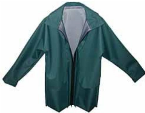
Fig.4. Laser welded waterproof jacket

An existing jacket design was modified to have seam designs and forms more suited to a laser welding fabrication. Additionally the total number of seams was reduced. A series of fabrication steps was developed starting from a pattern for the trunk followed by attachment of cuffs, pockets, collar and lapels. The welds were completed at a speed of 3m/min using a laser power of around 75W.