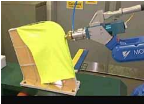
Fig.5. 3D processing for a hood seam

The equipment was also evaluated for the manufacturing of 3D seams. The hood for the waterproof jacket was chosen to demonstrate 3D processing as shown in Figure 5 .